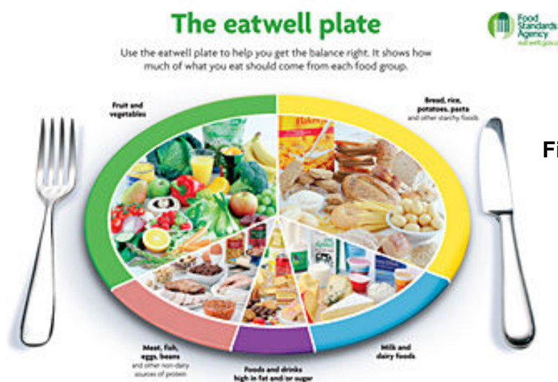
Figure 3 - The Eatwell Plate